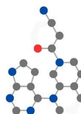
A small molecule medicine (tofacitinib)