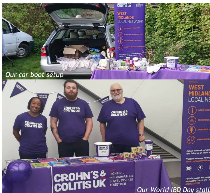
Our car boot setup